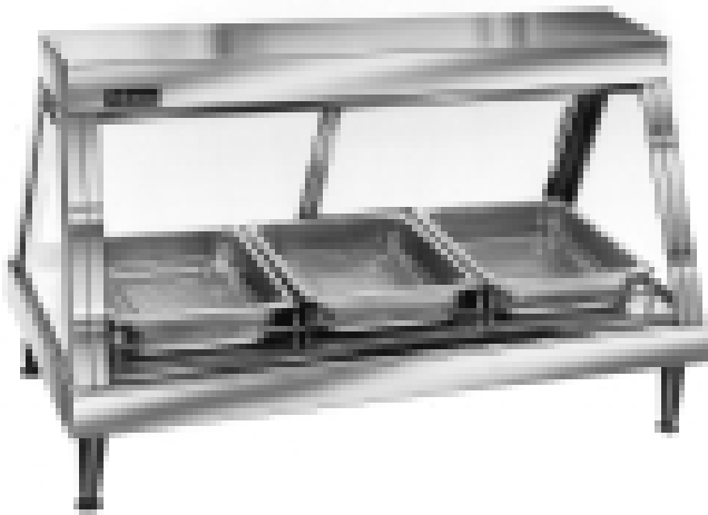
Model 1210-3P Shown (pans optional)

Ideal for convenience stores, mini-markets, delicatessens, or any place where counter space is limited.